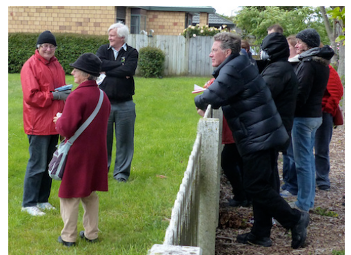
Checking out one potential site

The next meeting is scheduled for 7pm on Thursday 22 January at the Linden Social Centre.