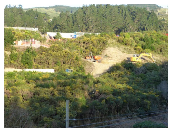
Between William Earp Place and the railway line.

Consent has been granted for a 26-unit development at 4 William Earp Place. This development does not use all of the subject site. The go-ahead has been given for earthworks to commence (see photo), with the developer's management plans having been signed off. Council does not have details of the developer's intended timelines.