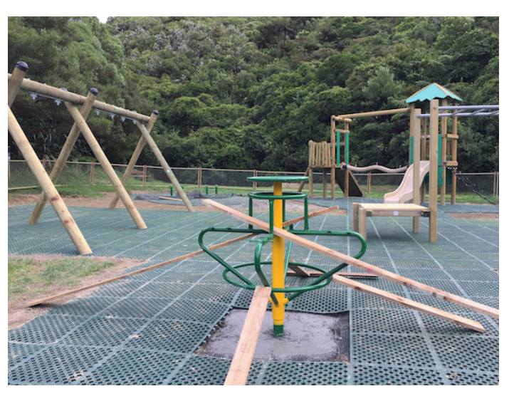
Upgrade at Brasenose Park nearing completion.

PLEASE BE AWARE that many of the items/articles in this newsletter have been sent through by members of the Tawa community and have been published 'unedited'. They may not necessarily reflect the views of the Editor.