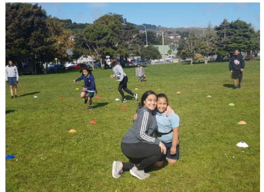
Top two photos: Year 9 Tawa College students teaching Ki-o-rahi at Redwood School; Lower photo: Year 12 students teaching Ki-o-Rahi at St Francis Xavier.