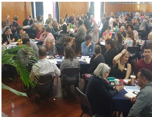
Above: Teachers from all our Tawa schools.