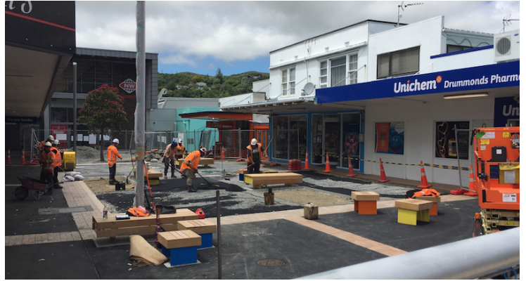
Hard at work on Monday 17 December

Our contractors will focus on completing Zones B and C from 7th January when they return to site to apply the finishing touches.