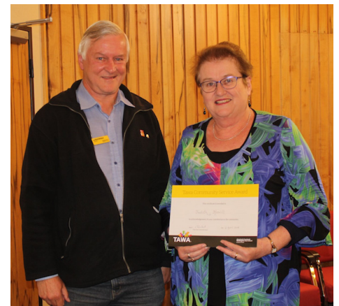
Tawa Community Service award winner in March 2018