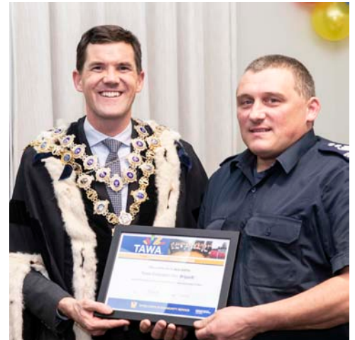
"Excellence in Community Service" award presented to the Tawa Volunteer Fire Brigade at the recent Tawa Community Civic Awards.