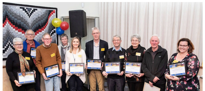
Heritage and Environment