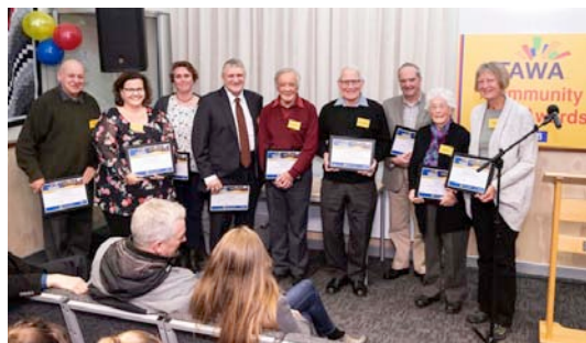
Health and Wellbeing