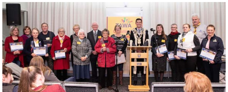
Education and/or Child/Youth Development