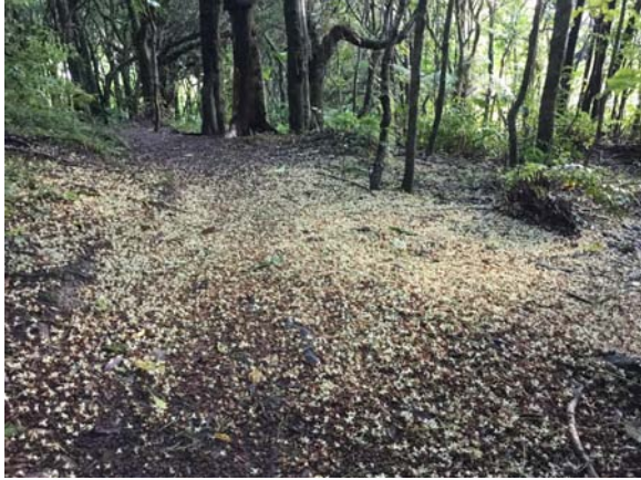
Carpet of flowers in Redwood Bush, 17 June

The prolific flowering this year is evident when walking in the reserves in May/early June as the white-coloured, orchid-like