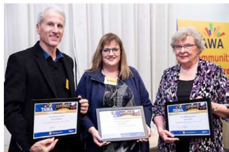
Arts and Culture