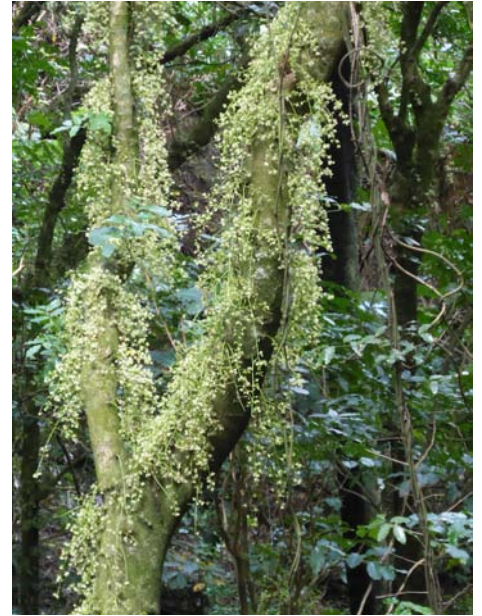
Wilf Mexted reserve, 8 June

flowers produce a sweet aroma – very evident when in the bush. Importantly the flowers produce nectar that is a key source of food at this time of year for tui and bellbirds. Later the flowers produce large green then black, golf-like fruit that enclose fleshy orange seeds that are a favourite food for kereru.