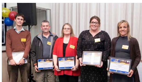
Sport and Leisure