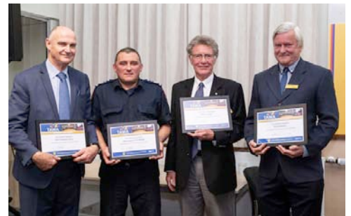
"Excellence in Community Service"