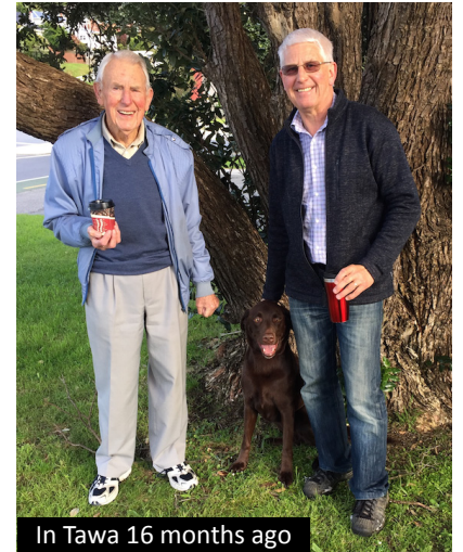
In Tawa 16 months ago

Four children, twelve grandchildren, and (as at 25 March 2018) nine great-grandchildren – not a bad legacy! Mum and Dad both celebrated their 90th birthdays with great family get-togethers,