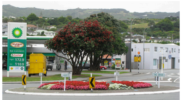
Summer shot of the floral display at the BP roundabout

A significant number of local people expressed their concerns about that proposal, primarily on Neighbourly, and those concerns were passed on to Council.