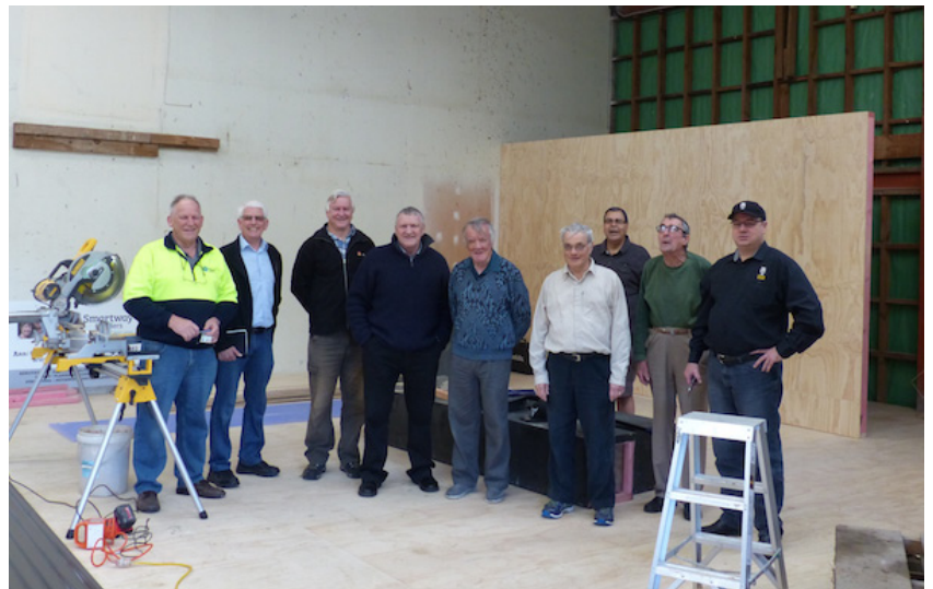
MenzShed committee members in the 'Shed' currently being upgraded

You can help – please see https://givealittle.co.nz/cause/help-tawa-menzshed-get-off-the-ground