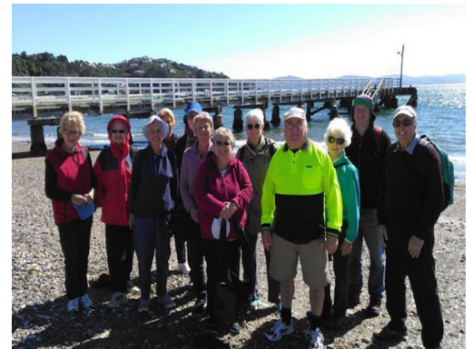
The Rambling Group is a popular U3A Tawa activity

The aim of U3A Tawa is to provide low-cost educational and recreational opportunities for adults, primarily in retirement, who wish to learn in a social environment.