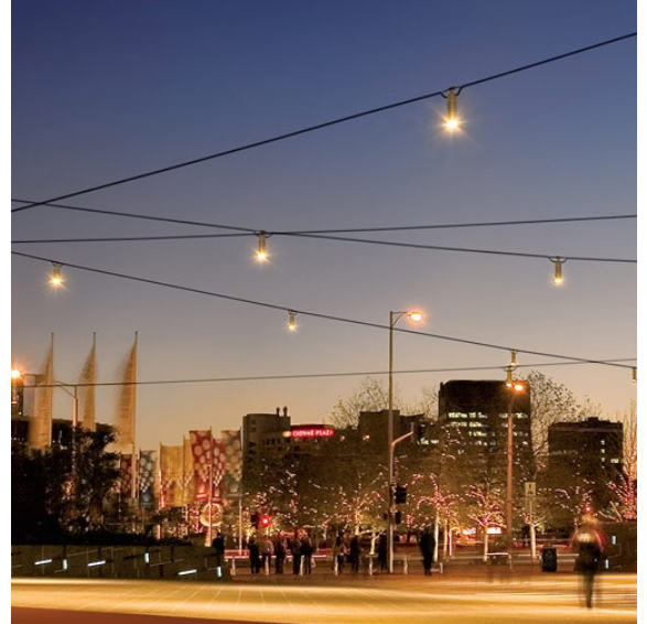
Example of catenary lighting

More information on catenary lighting: https://www.ronstantensilearch.com/landscape-lighting-catenary/