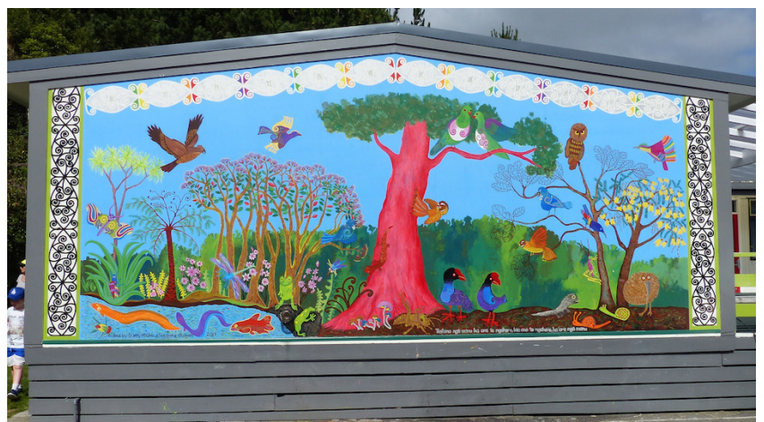
On a totally separate note, this is the new mural at Greenacres School