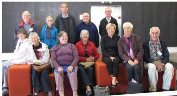
The Ancestry Search Group visiting the National Library

U3A Tawa offer around 40 courses and activities covering a wide variety of topics and recreational activities. All current members and prospective members are welcome to attend the morning tea to find out more about U3A Tawa. Information on all courses