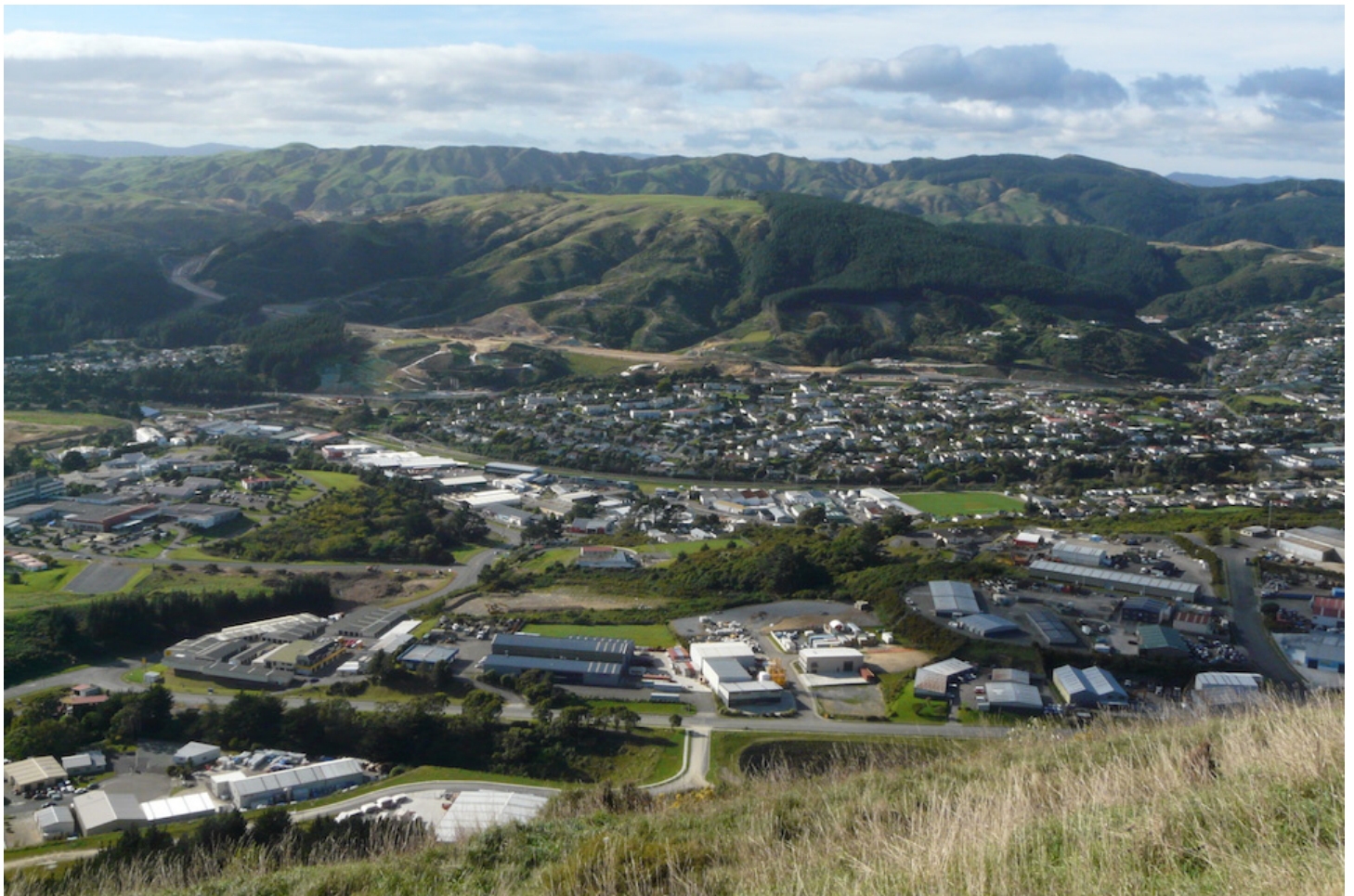
Early April update on progress with the Linden end of Transmission Gully

See www.tawalink.com/newsletters.html for back issues of the newsletter.