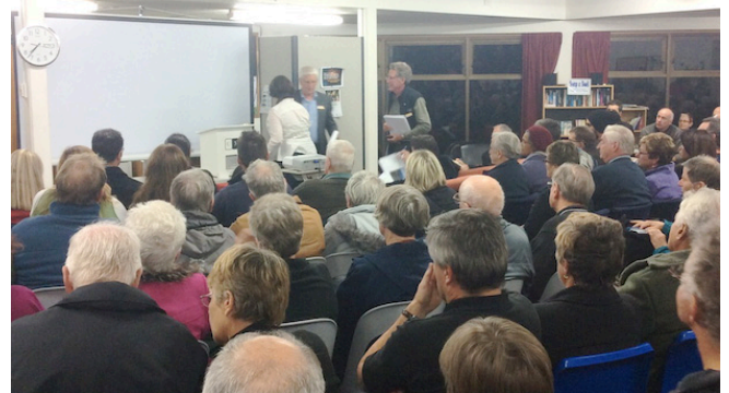
160-180 people at the meeting organised by the community board in April 2014 to give local people the chance to find out more about NZTA's proposals

NZTA (NZ Transport Agency) released its decision very recently advising there will be no widening of SH1 through Tawa and no new road through Takapu Valley!!! This is very pleasing news for the many local residents who would have been affected (in many cases severely) by one option or the other. It vindicates all the efforts put in by many committed individuals who stressed that the third option, "abandon both proposals", was a viable alternative. And so it has proven to be!