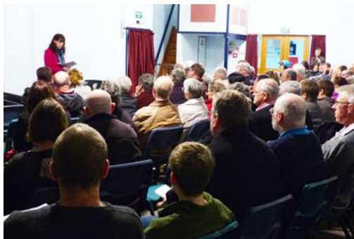
Around 85 people at the meeting in June 2015 organised by the community board to bring local people up-to-date with NZTA's proposals

Well done to all the campaigners from the "Stop the Motorway Widening Group" and "Save Takapu Valley". One would assume there would have been huge sighs of relief and a massive burden lifted from the shoulders of both groups of residents!