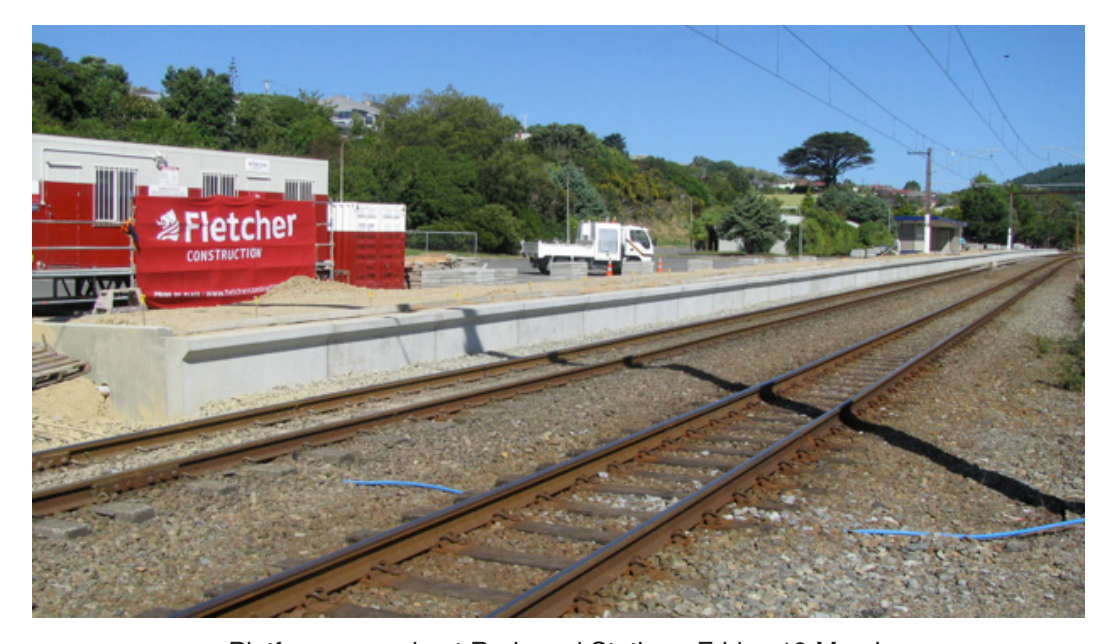
Platform upgrade at Redwood Station - Friday 19 March

Thinking about selling your house? Please feel free to call me personally for a chat or for an appraisal.