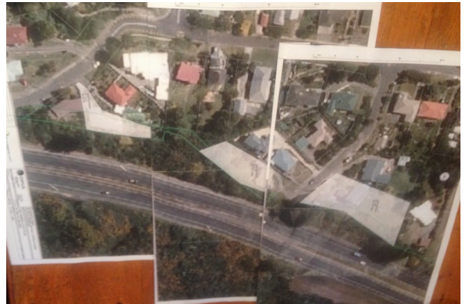
Three individual maps - as presented to individual residents in Cecil Road and Ongley Cres - joined together to show how their properties are likely to be adversely affected.

By now you'll probably be aware that the NZ Transport Agency is contacting Takapu Valley residents to advise them of the possibility of a two-lane highway being constructed through their valley to link up with the yet-to-be-built Transmission Gully. At the same time Tawa residents are being contacted by NZTA with the advice that the alternative to the Takapu Valley option is to widen the motorway through Tawa. Both proposals would have major effects on residents and are causing huge concerns and resulting in some very upset people - with just cause!